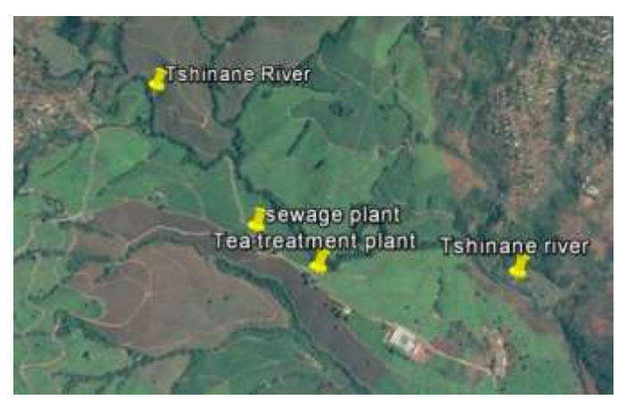
Fig 3: The location of the sewage plant and tea processing plant and Tshinane River

The phosphate and nitrate levels in the Tshinane River probable originate from anthropogenic and not from geological sources (Figure 3). The anthropogenic sources are probable from the discharge of black tea processing wastewater and discharge from sewage plant with regards to the nitrate levels and from commercial and subsistence farming operations. This may be true since the nitrate levels seem to increase downstream of Tshinane River. In separate study in the Luvuvhu River catchment it was shown that the nutrient enrichment was partly due to sewage discharge [11]. This study is in agreement with the study of Han et al. [12] in China that nitrate from a tea plantation was the source of nitrate in their environment.